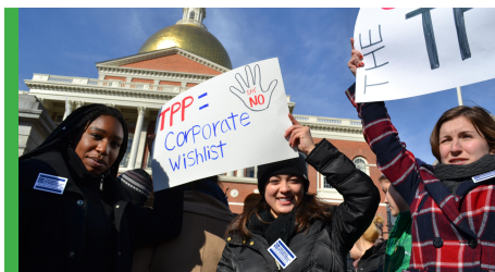
PHOTO: People around the world say no to the TPP. It threatens to decrease people's access to medicine, water down food-safety laws and undermine tobacco control advances.

If passed, the Trans-Pacific Partnership (TPP)—the largest and most secretive “free trade” agreement ever negotiated by the United States—threatens to extend Big Tobacco's deadly reach. But with your support, Corporate Accountability International is exposing the backroom negotiations through