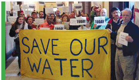
PHOTO: St. Louis residents make clear their desire to keep the city's water in public hands.

This year, Veolia attempted to ram through a contract with the city of St. Louis, Missouri. For $250,000 the global water giant hoped to gain a foothold in the management of the city's water system. But the groundswell of grassroots pressure you helped generate succeeded in blocking the contract.