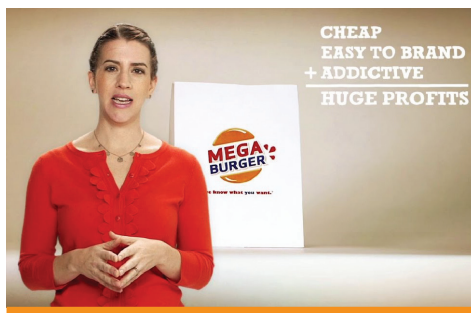
PHOTO: The new Food MythBusters film reveals McDonald's spends about $2 billion annually on marketing tactics ranging from celebrity sports endorsements to online "adver-games," in its attempts to undermine parents and persuade kids to eat junk food.

The new Food MythBusters short launches at a time when McDonald's