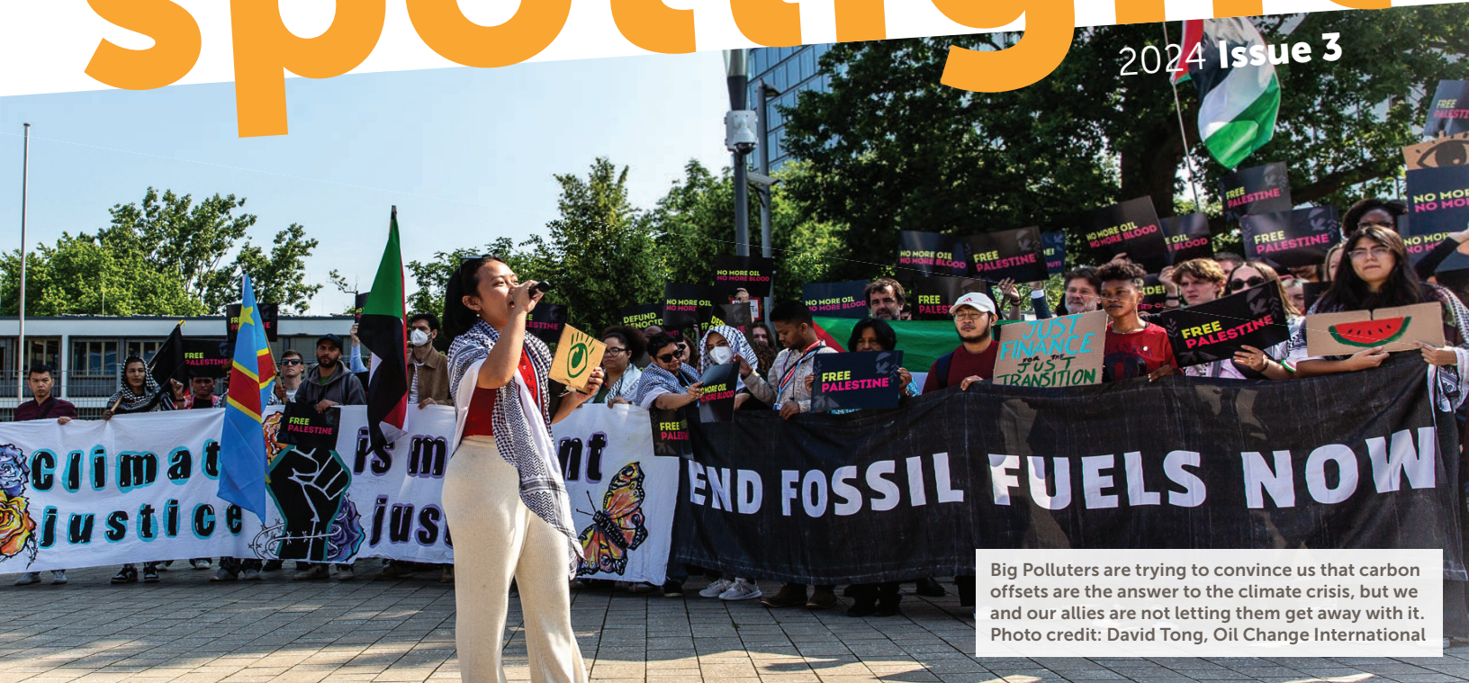
Big Polluters are trying to convince us that carbon offsets are the answer to the climate crisis, but we and our allies are not letting them get away with it.