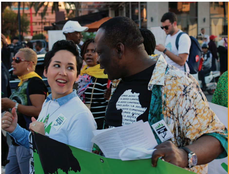
Corporate Accountability International staff and activists rally for climate justice during the U.N. climate treaty meetings (COP22).

600,000 people demand that climate policy be protected from the fossil fuel industry