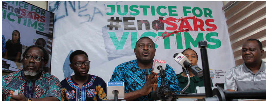
Activists from Corporate Accountability and Public Participation Africa (CAPPA) at a November 2020 press conference demanding justice for the victims of the Lekki Massacre in Lagos.

How you stepped up to show international solidarity with our global allies