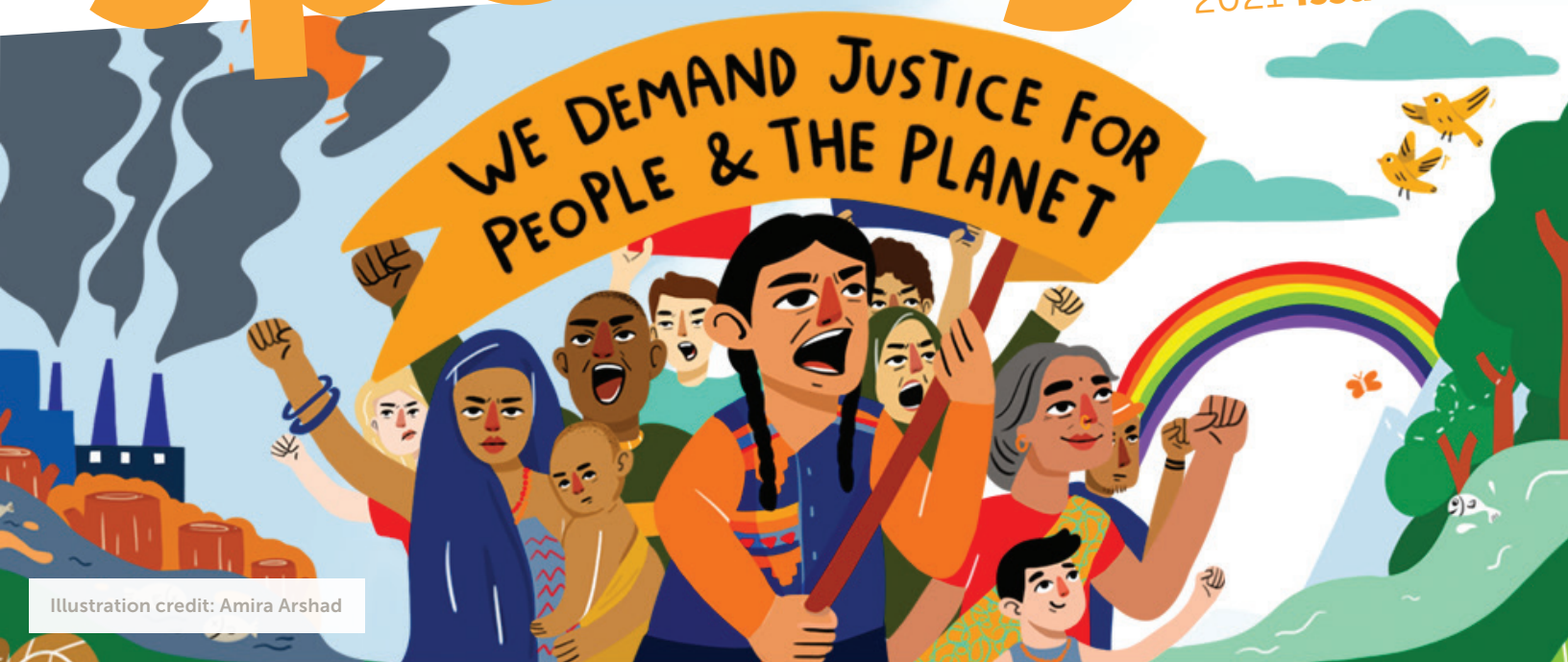
Illustration credit: Amira Arshad