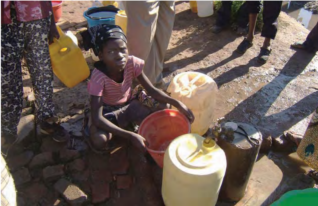
A young Zambian girl waits in a long line to fill water canisters at a privately owned spigot.

of sea level, the decline of glaciers, against the end of irrigation and the spread of desert, against privatization