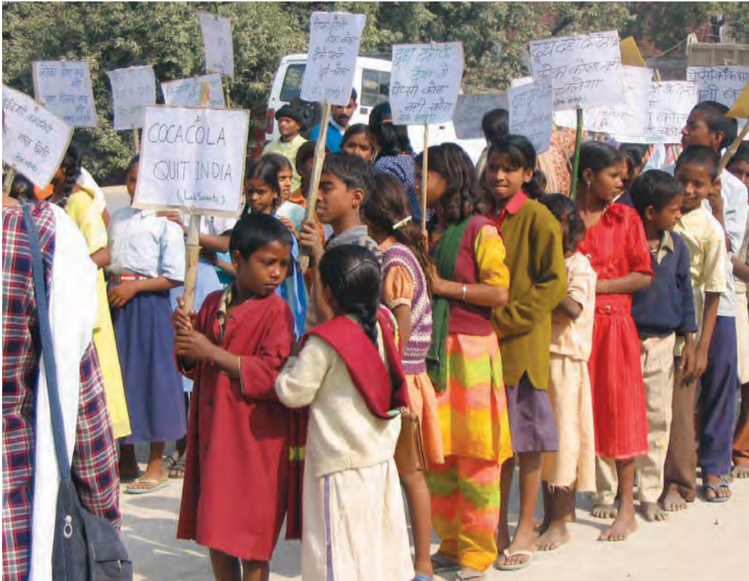
Indian schoolchildren protest Coke's bottling practices.

Council came up with some disturbing results. While most brands were safe, some violated state standards on bacterial contamination, and others were found to contain harmful chemicals such as arsenic. 36