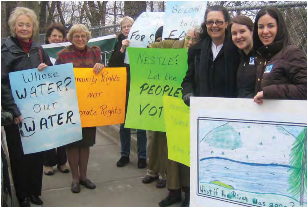
Corporate Accountability International staff and Franciscan Federation allies gather outside a Nestlé shareholders' meeting.

safety, and local traffic flow, with an estimated 200 to 300 diesel trucks servicing the plant per day. 19