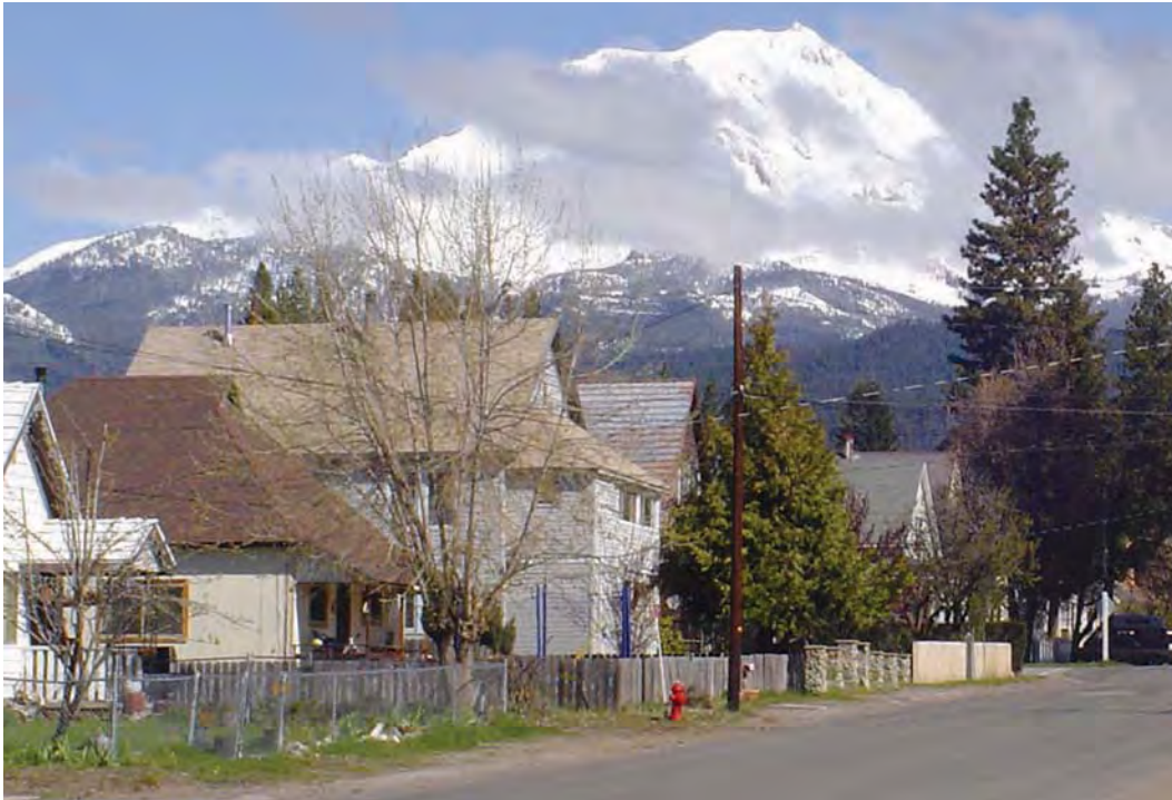
Mount Shasta looms over a street in McCloud, California, where Nestlé hopes to mine water.

year, the board governing McCloud's water services approved a 50-year deal under which the corporation agreed to pay the city between $300,000 and $400,000 a year to house a million-square-foot bottling facility. 16